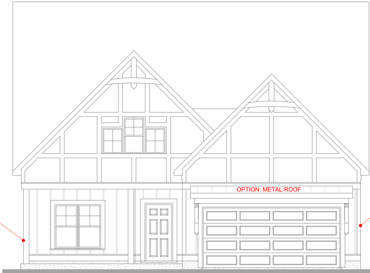
FRONT ELEVATION- A VERSION