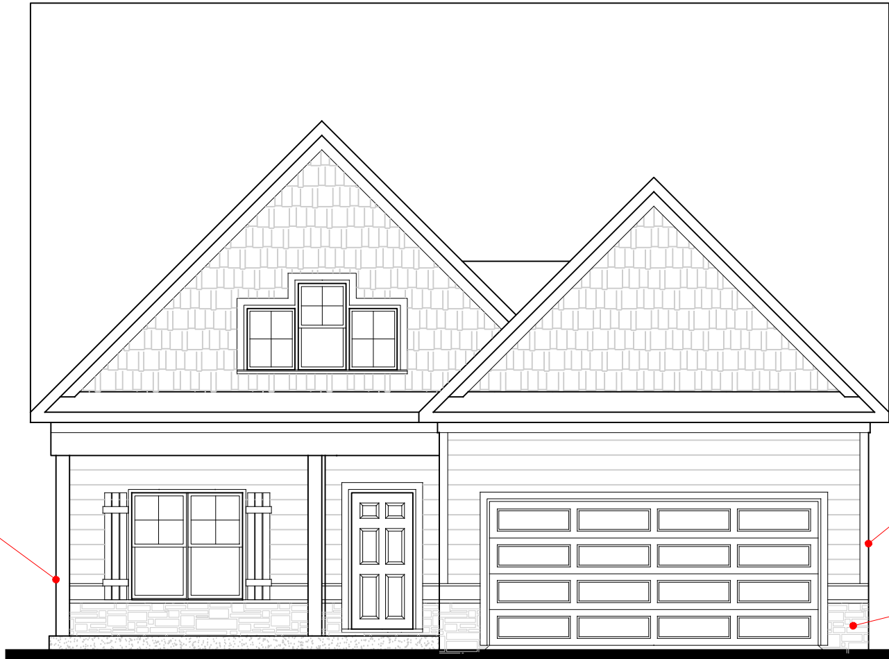
FRONT ELEVATION- B VERSION