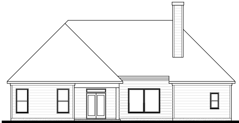
REAR ELEVATION- STANDARD PATIO