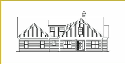
BENSON A XL

Base Price: $699,900 2,977 sqft 4 Beds 3 Baths